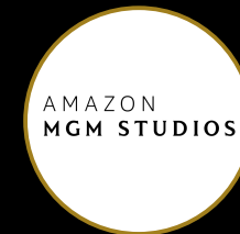
Amazon MGM Studios Bob Frandzel Community Service Award