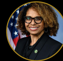
Congresswoman Sydney Kamlager-Dove The Karen Bass Award