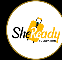
She Ready Foundation Reimagine Award